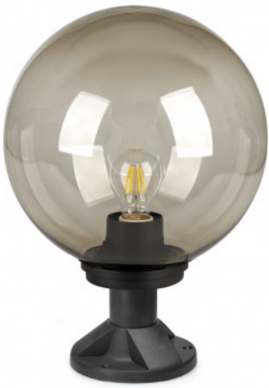
F6003-SM + FB1490