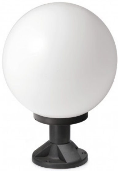
F6003-WH + FB1490