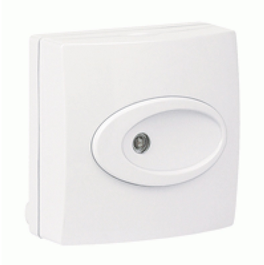
Sloping ceiling mount