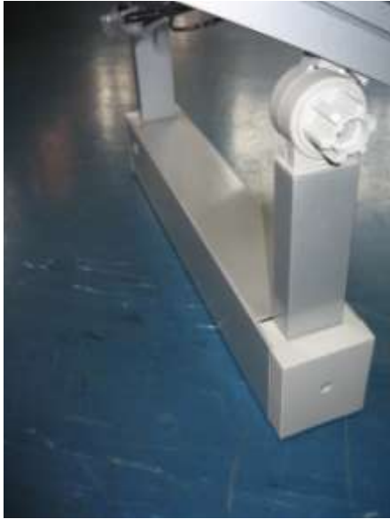
SR spotlight mounting base