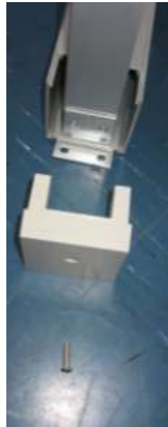
Unscrew plastic end cap to get to mounting holes